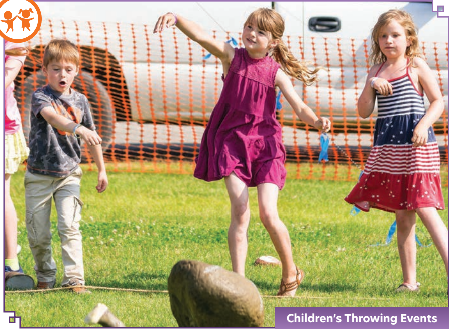
Children's Throwing Events