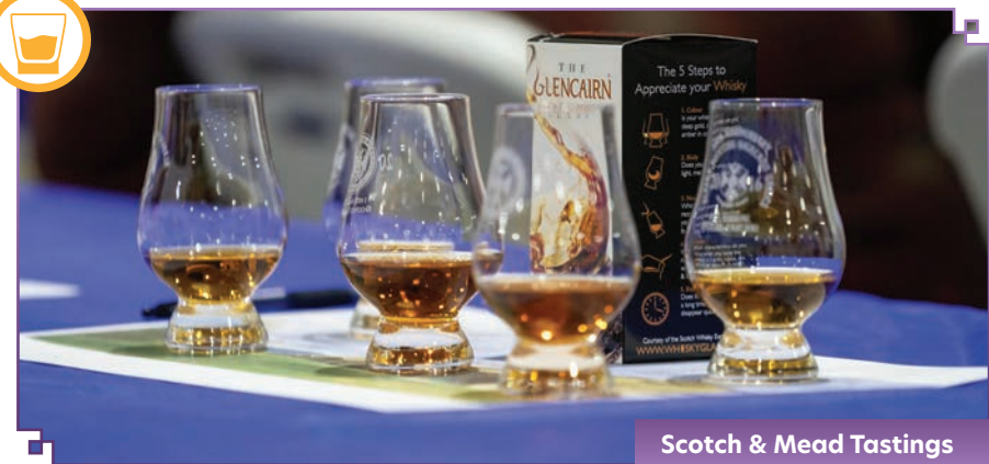
Scotch & Mead Tastings