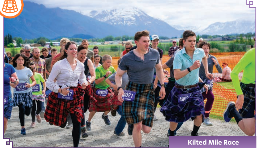
Kilted Mile Race