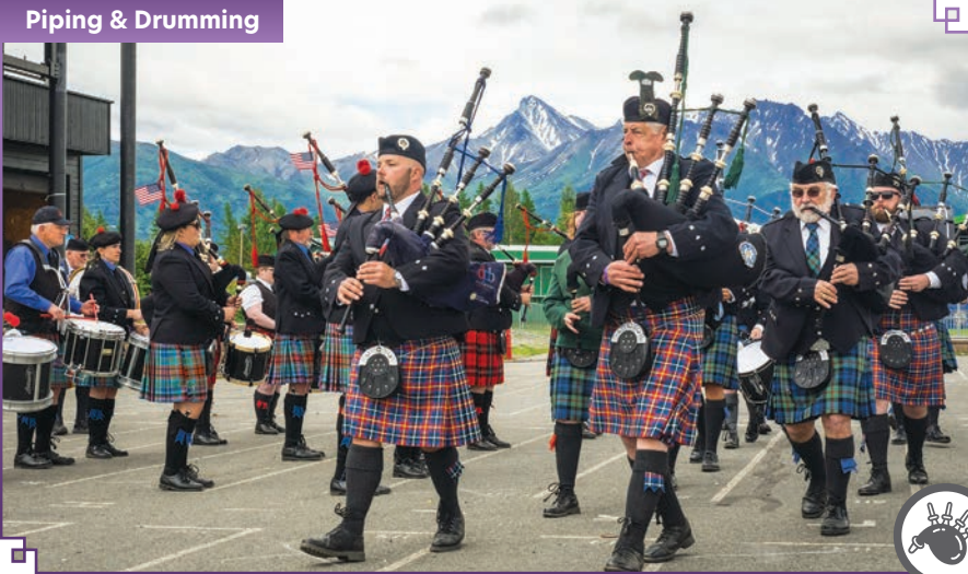
Piping & Drumming