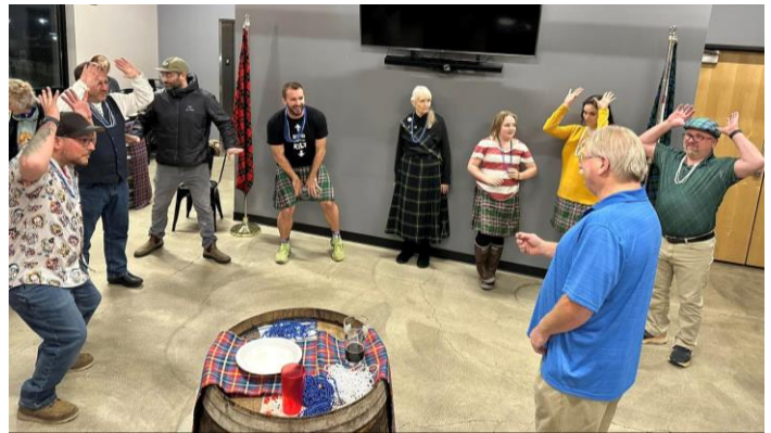
Kilts or Crowns?