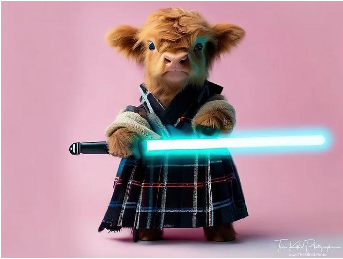
The Jedi Coo