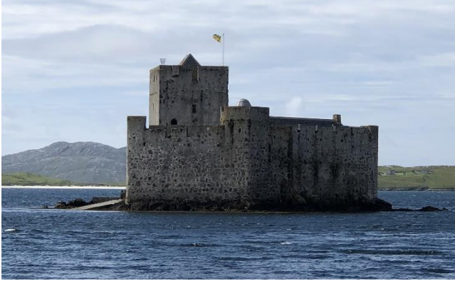
Kisimul Castle, Castlebay, Barra, Scotland

Gaelic) and closely resemble the Viking boats which were common when the Vikings occupied the Outer Hebrides. Galleys were propelled by sail but more often with oars.