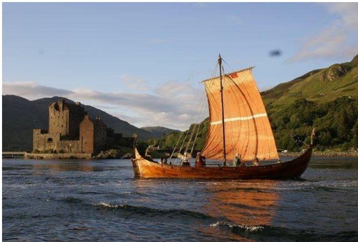
Hebridean Galley, Outer Hebrides, Scotland

His raiding of English ships eventually brought Ruari the Turbulent to the attention of Queen Elizabeth I. She was not happy with losing her ships and their cargo often gold. She put an enormous price on his head, but his clansmen wouldn’t dream of betraying him. Ruari seemed safe behind the strong walls of Kisimul Castle.